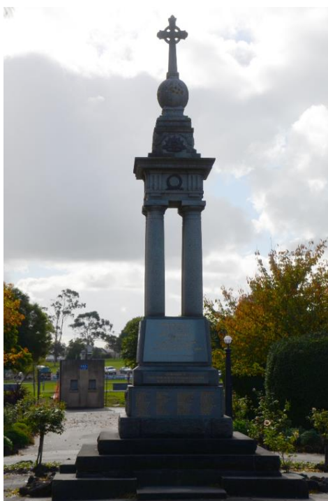
Mount Gambier War Memorial